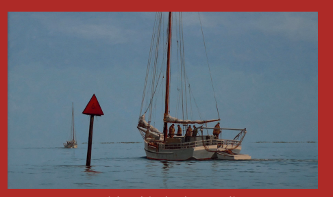
2020 - Keith Whitelock "Heading Out"