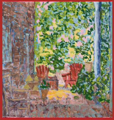
2021 - Sheryl Southwick "View from the Porch"