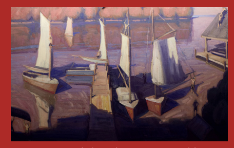
2019 - Christopher Best "Ten Kids"